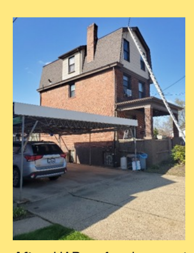
After: HAP roof replacement