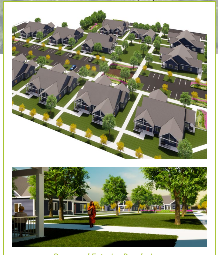
Proposed Exterior Renderings

Tryko proposes to develop the former site of the Fairywood school into affordable town-homes for seniors aged 62 and up. Tryko is a local experienced affordable housing company with management and ownership of more than 6,000 apartment units, including several large communities located in the Pittsburgh region such as Emerald Gardens, the apartment community located next door to the Fairywood site.