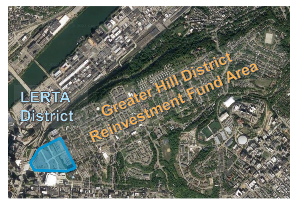
Above: Approximation of the LERTA District & GHDRF Area