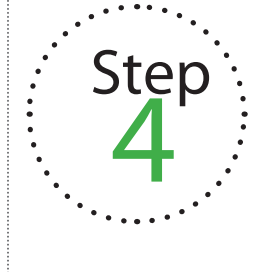
SUSTAINABILITY MEETING Development team, URA contact and GBA representative will meet to discuss project, current sustainability goals expressed by early checklist / questionnaire, and other opportunities.