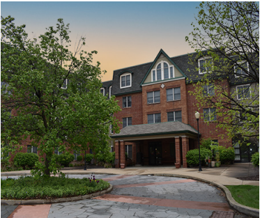
Allegheny Pittsburgh, PA 75 units