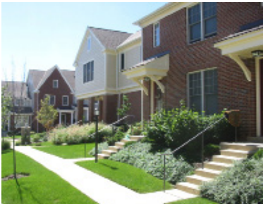
Reserve at Summerset Pittsburgh, PA 40 units