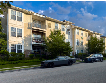
Gateway at Summerset Pittsburgh, PA 131 units