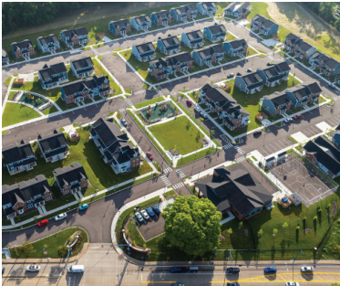
Heritage Highlands Rankin, PA 105 units